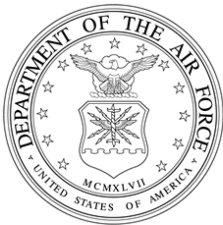
Figure A2.1. Department of the Air Force Seal.

A2.1.2. AFPAA approves use of facsimiles of the seal. This includes use on insignia, flags, medals, and similar items. AFPAA also approves industry or AF groups request for use of other parts of the seal.